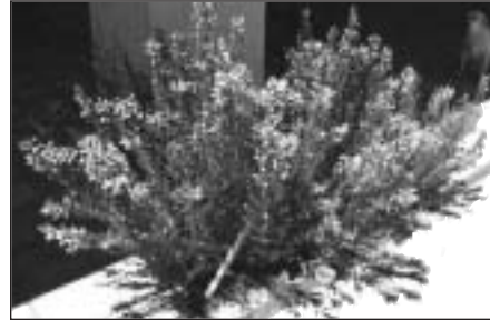
Poliomintha maderensis , Lavender Spice™